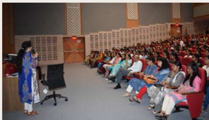
Student Mentorship launch