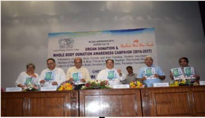
Organ & body donation awareness campaign, Anatomy