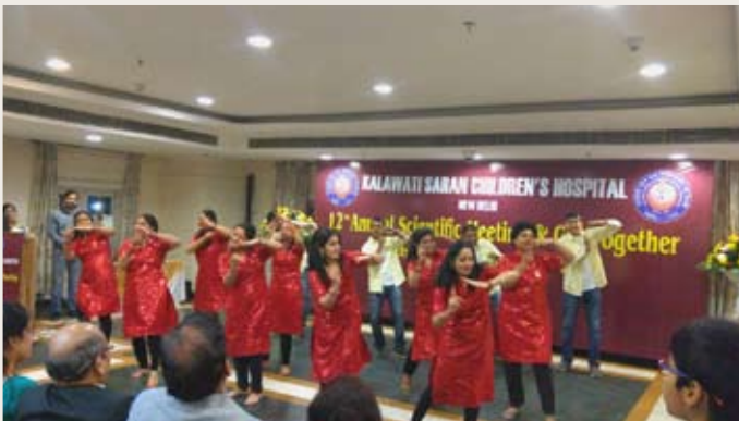
12th Annual get together of KSCH