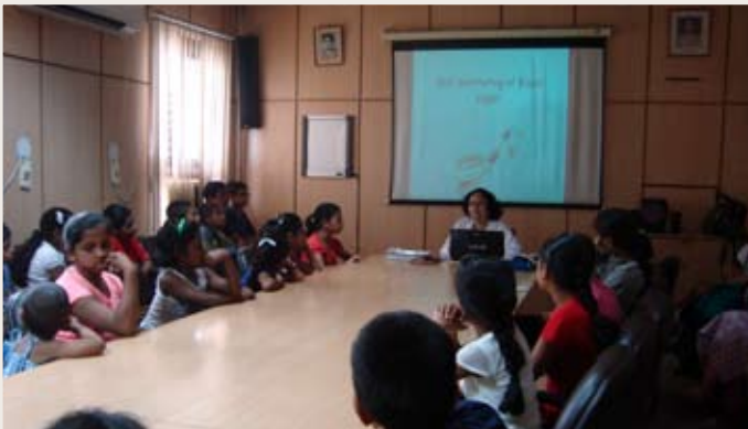
Diabetes self-management skills for adolescents, Pediatrics