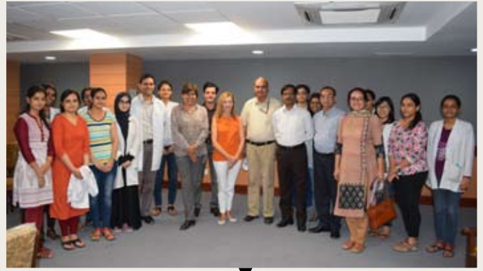
Guest lecture, Ophthalmology