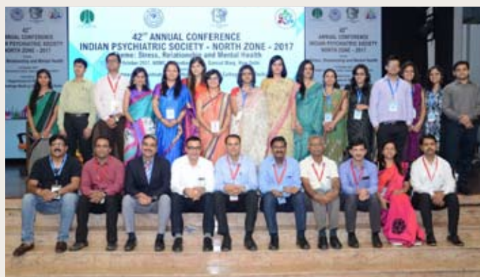
IPS-NZ Conference, Psychiatry