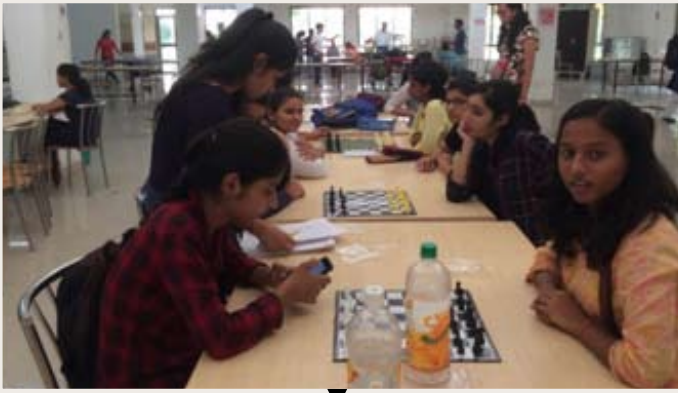
Undergraduate students participating in Enthral