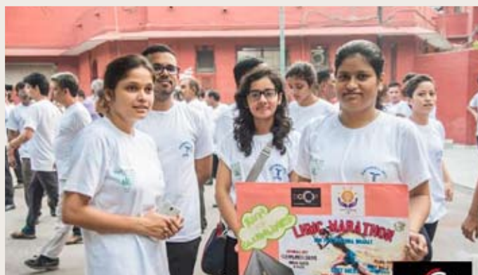
Students Participating in LHMC Marathon