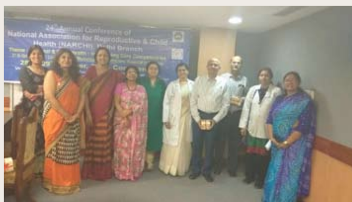
NARCHI workshop in Oct 2017