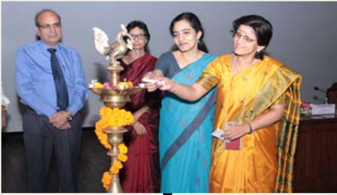
Inauguration ceremony of DAPCON 2017, Pathology