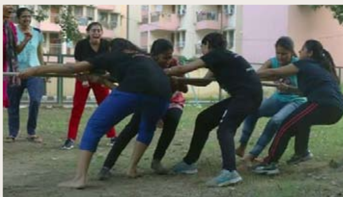
Undergraduate Students Participating in Enthral