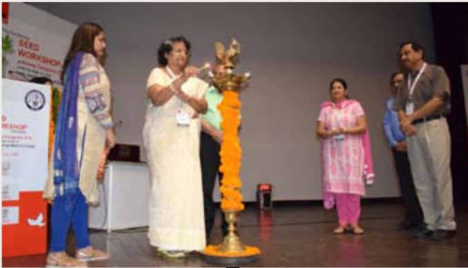
Seed Workshop on Airway management, Anaesthesia