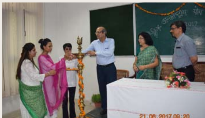
International Yoga Day Celebrations, Physiology