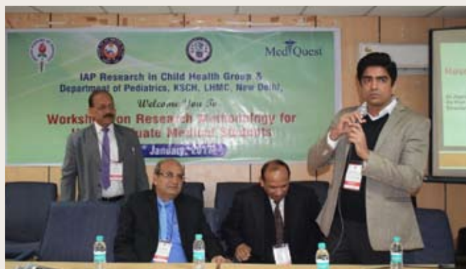
IAP Workshop on research Methodology for Undergraduate Medical Students