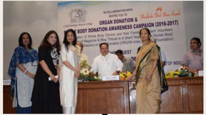
Organ & body donation awareness campaign, Anatomy