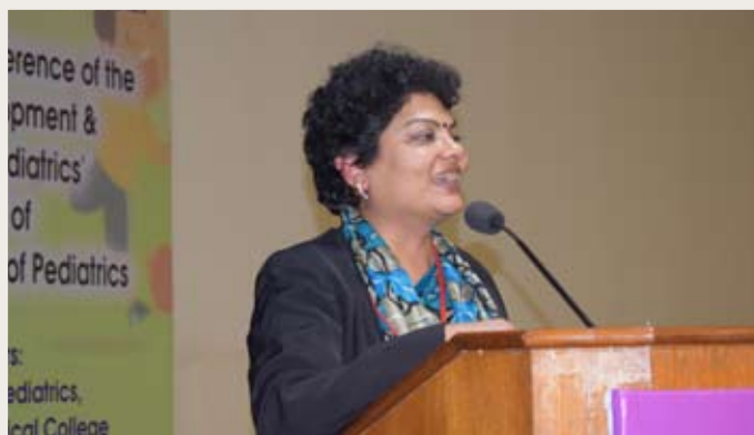
National conference of IAP chapter on GDBP, Pediatrics