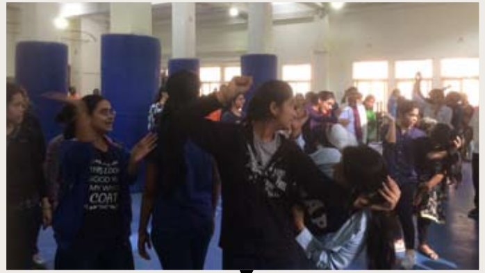
Undergraduate students participating in Self-Defence training