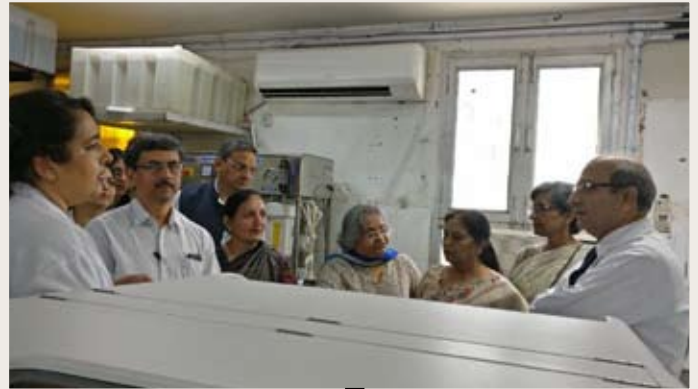
Inauguration of Autoanalyzers in clinical Biochemistry Laboratory