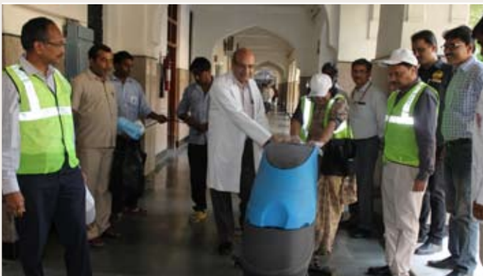
Swachhta drive day activity, LHMC