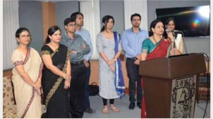
CME by Department of Anaesthesia