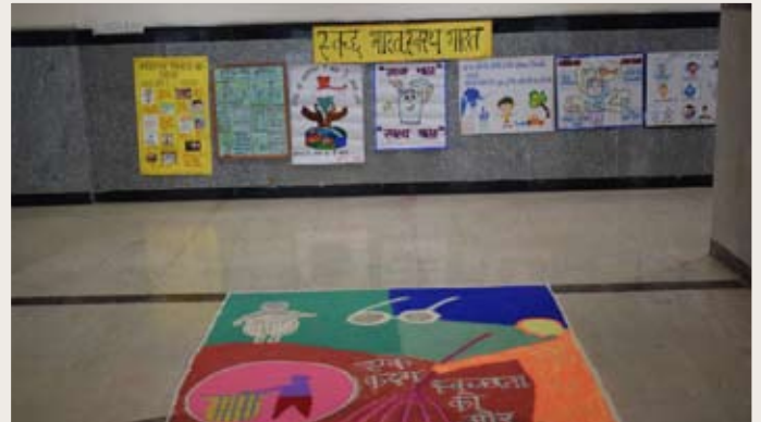
Rangoli by Undegradate students on Swachhta Abhiyan