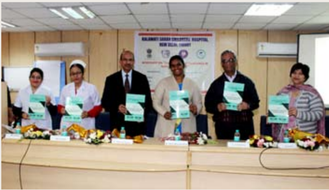
Release of souvenir by Continuing Nursing Education cell