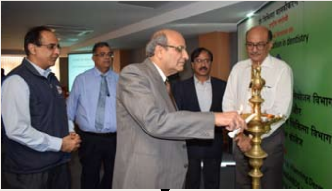
National Seminar on Standardization in Dentistry