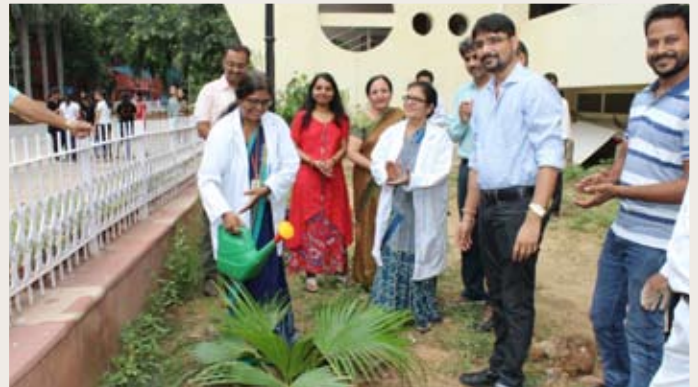
Plantation Drive at LHMC