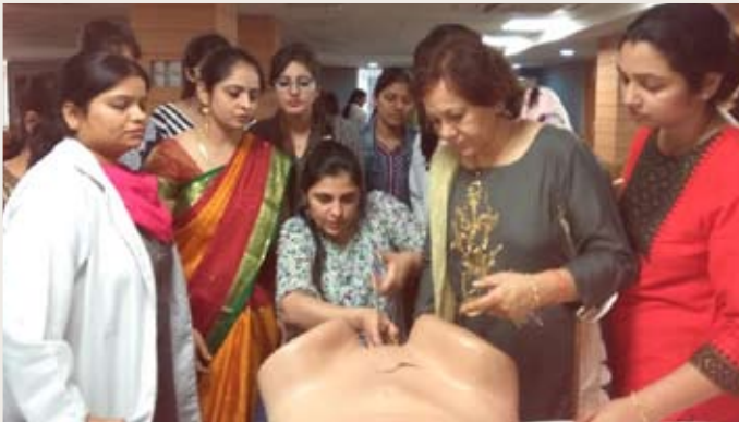
Hands on Workshop on PPIUCD, IUCD –No touch technique, OBG