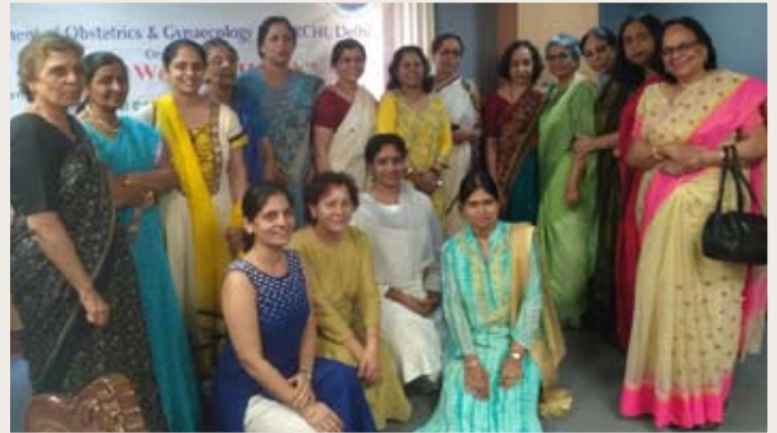
CME on women's health, OBG