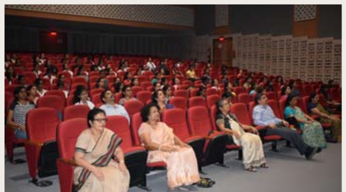
SLM- Life strategies: Practising Breathing exercise