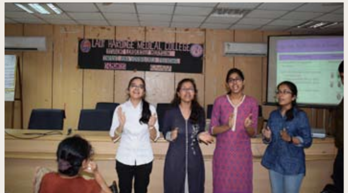
SLM: Seminar on Infant and young child feeding