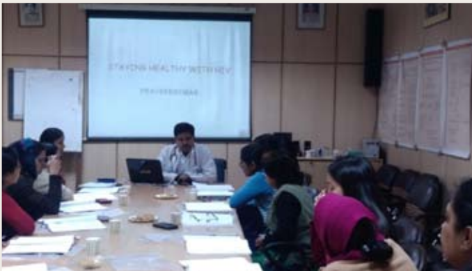
Training of ART centre Councillors