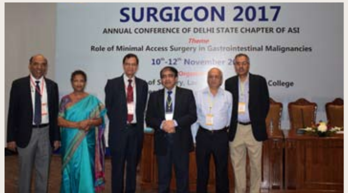
Inauguration of SURGICON-2017, Surgery