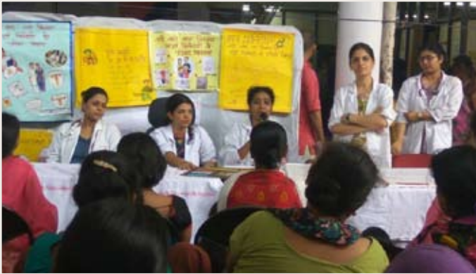
Public awareness on contraception, Department of OBG