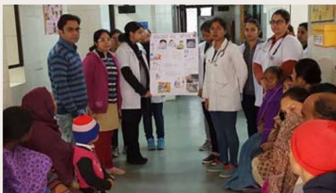
Swachh Bharat Abhiyaan activity