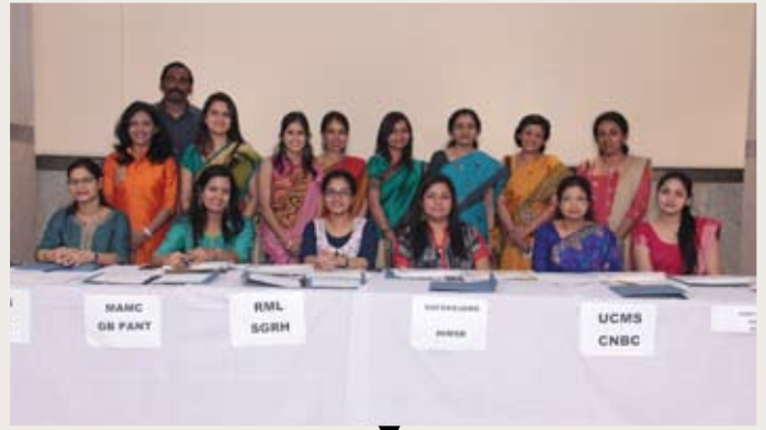
DAPCON 2017, Pathology