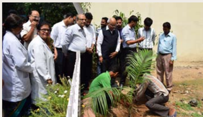
Plantation Drive at LHMC