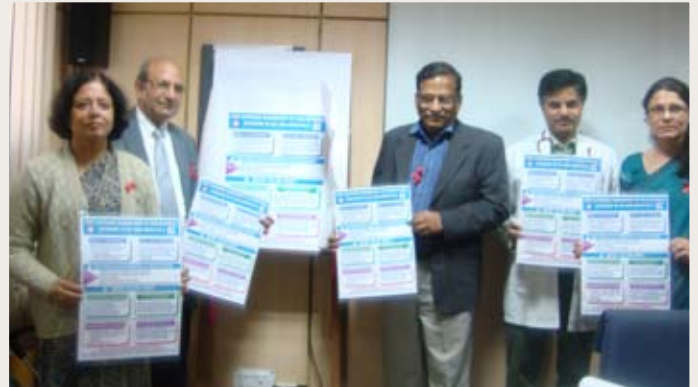
Poster release ART centre, Pediatrics