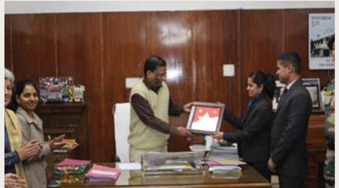
Educational Tour for Students of Srinagar under Indian Army's SADBHAVANA, Anatomy