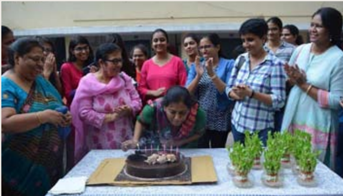
Hostel Day Celebration for undergraduate Students