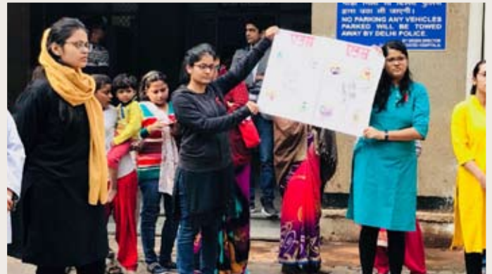
SLM: Street play on AIDS awareness