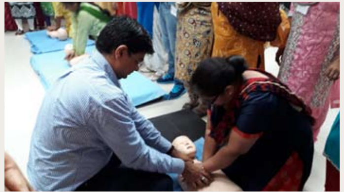
BLS training for nursing officers, CNE cell