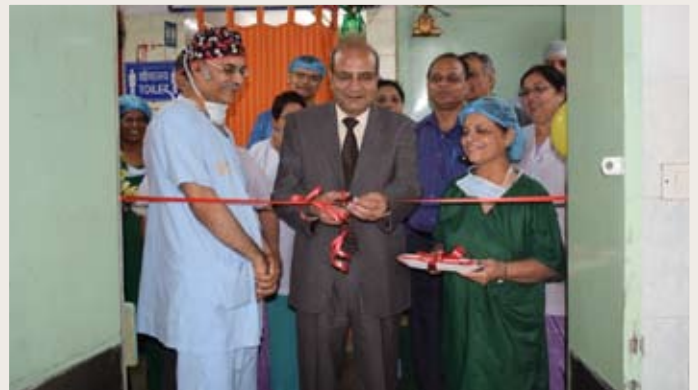
Inauguration of post-operative recovery room KSCH OT