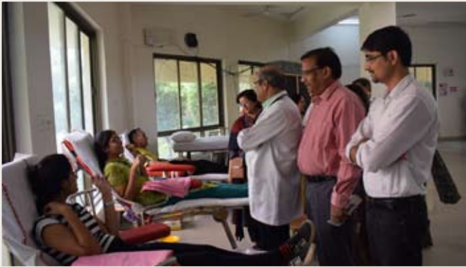
Blood donation drive at LHMC