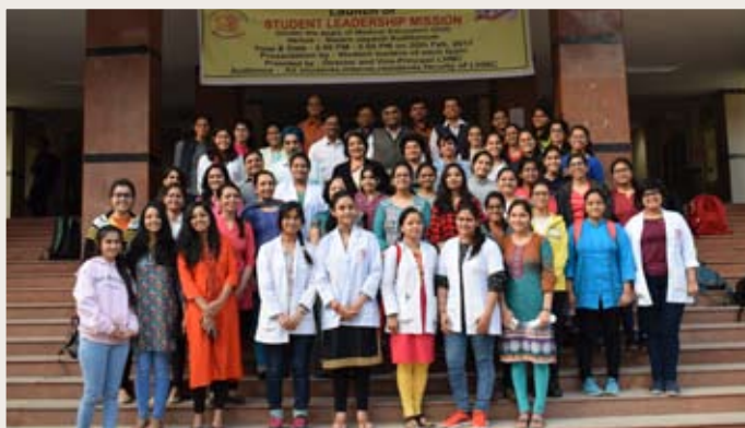
Launch of Student Leadership Mission (SLM)