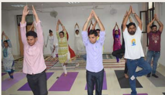
International Yoga Day Celebrations, Physiology