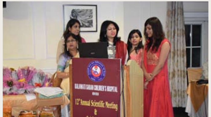
12th Annual get together of KSCH