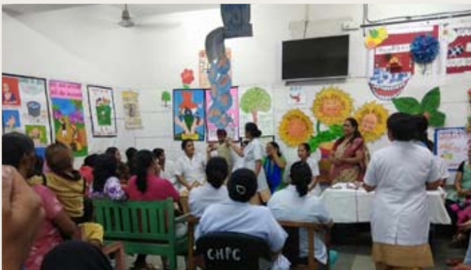
Swachh Bharat Abhiyaan, KSCH