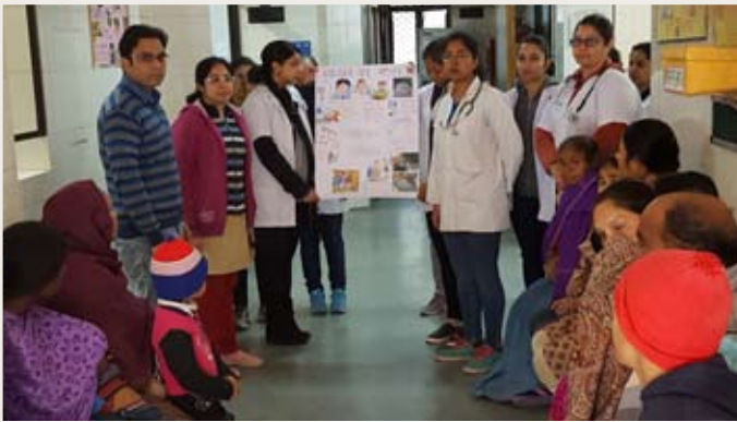
Swachh Bharat Abhiyan at UHC, Kalyanpuri, Community Medicine