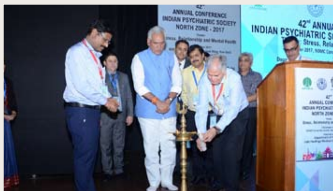
Inauguration of IPS-NZ Conference, Psychiatry