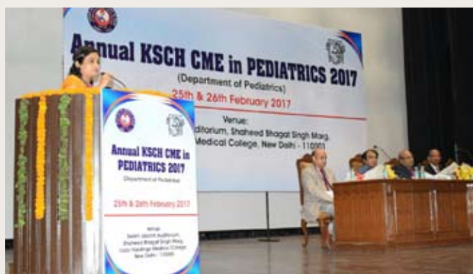
Annual KSCH CME in Pediatrics