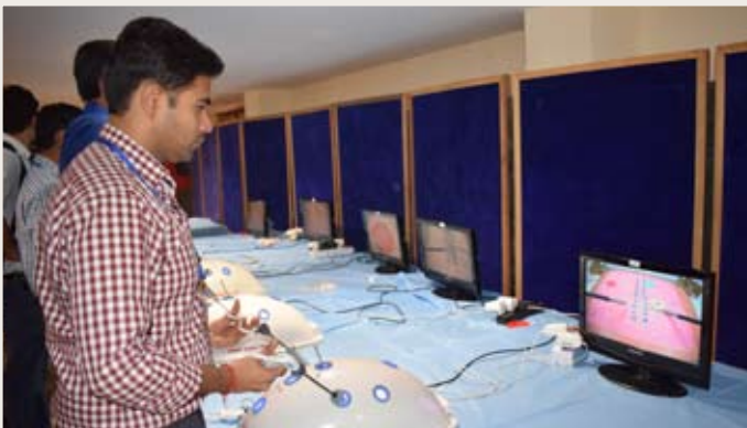
Skill course for post graduates, Surgery