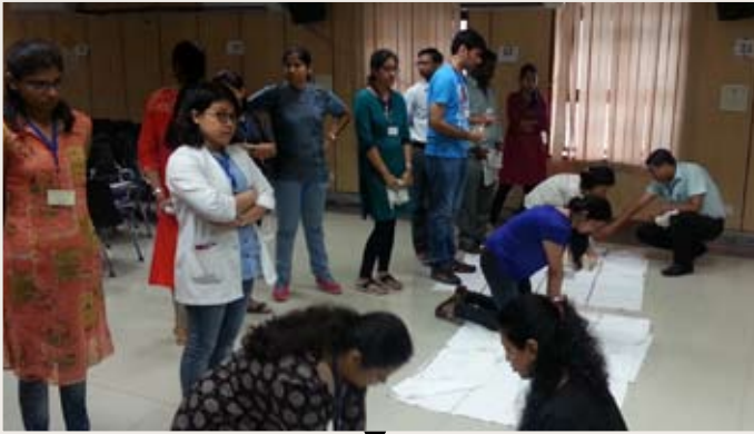
PALS course for Post graduate students, Pediatrics