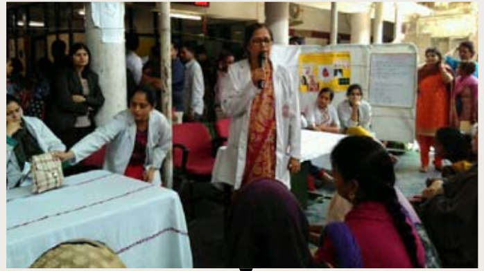
Public awareness on Heart Disease in Pregnancy, Department of OBG