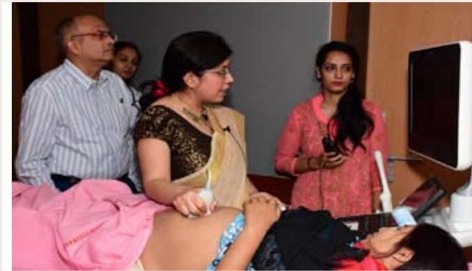
Workshop on fetal ultrasound, OBG