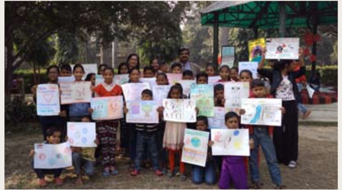
World AIDS day celebration at UHC, Kalyanpuri, Community Medicine