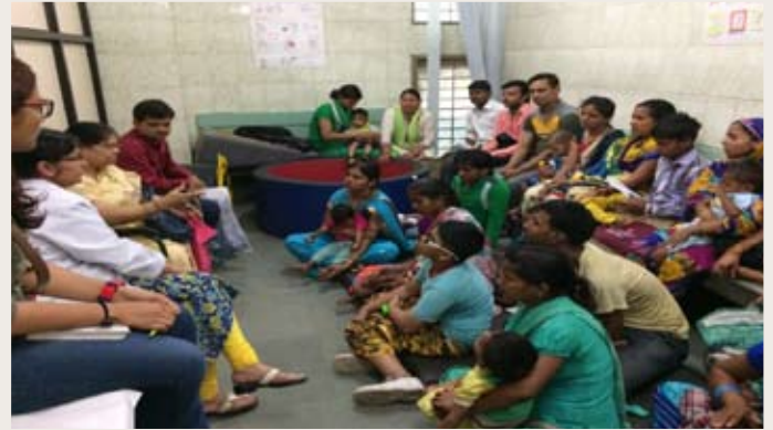
Education of Parent's on Cerebral Palsy, PMR