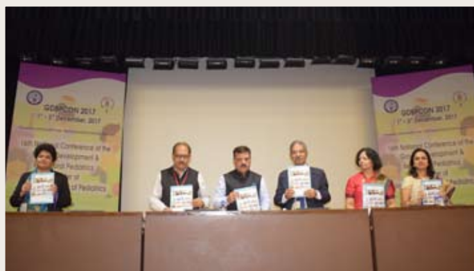
National conference of IAP chapter on GDBP, Pediatrics