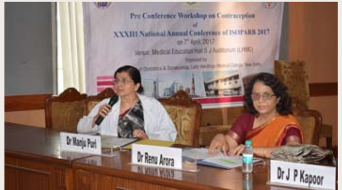
Workshop on contraception, OBG