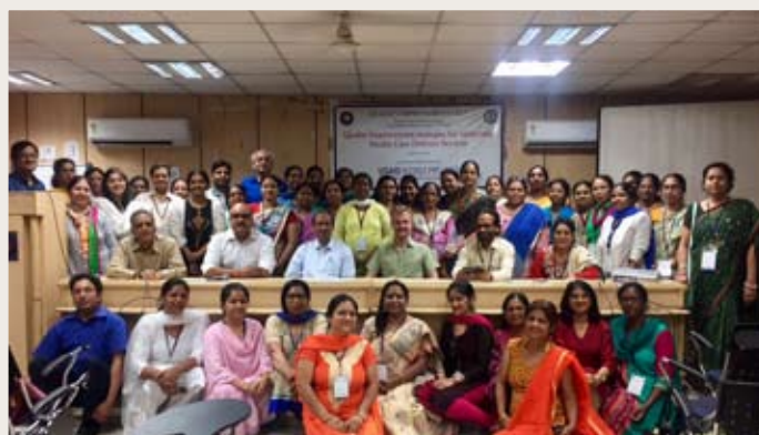
Quality Improvement Workshop for Nurse Educators