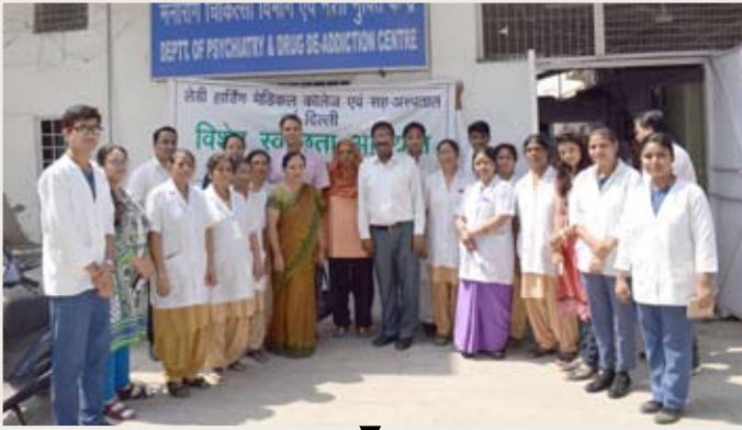
Special cleanliness drive, Department of psychiatry