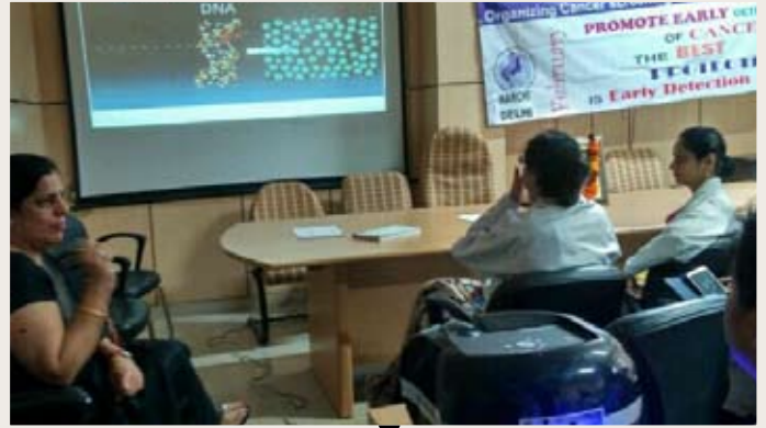
CME on Genital Tract Malignancy, OBG